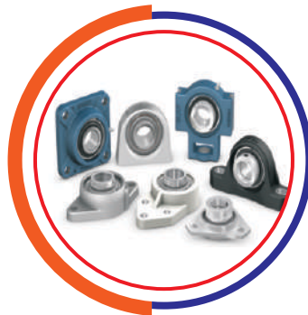
Roller Idler, Bearings & Fasteners