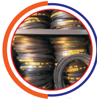
Conveyor Belts & V-Belts