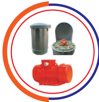
Butterfly Valve, Motor Vibrators & Filter Cartridges