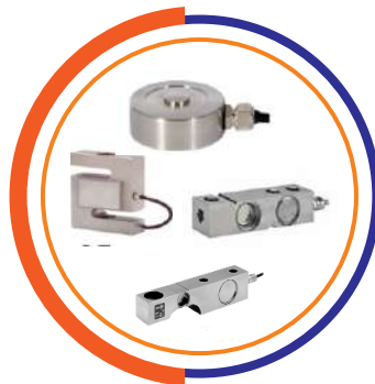
Hanger Bearing, Screw Conveyor & Load Cells